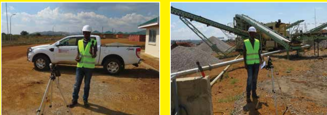
Figure 1 COSH Consultant measuring air quality and noise level at Kikagati Hydro Power Project

We have got internationally recognized specialists responsible for preventing, reducing, and eliminating harmful situations in the workplaces. These individuals whose services have been utilized by clients in construction, manufacturing and oil and Gas sectors have set up Workplace Health Safety Management Systems (WHSMS) in our clients' workplaces.